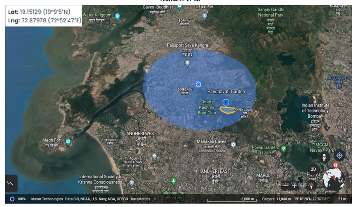
Figure 1. Map of the study area

transects were fixed in the routes along the paths once in a week covering an area of 50 meter around a radius of 5 meter front from the observer and 2.5m on either sides. All zoological names and identification used in the present study are in accordance with Varshney (1983), Kehimkar (2008) and common English names were used from Wynter-Blyth (1957). The observed butterflies were categorized into five groups on the basis of relative abundance in the study area as VC-very common (75-100 sightings), C-common (50-75 sightings), LC-less common (25-50 sightings), R-rare (5-25 sightings), VR-very rare (1-5 sightings). The diversity indices and evenness were worked out by following Shannon Wienner diversity index.